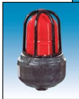
XB15 Pipe Mount Note: UL only (with cast guard)